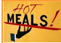
Table Fellowship for the WEEK OF OCTOBER 15 St. Peter's Church, 121 Church St.

Sun: Is 25:6-10a/Phil 4:12-14,19-20/Mt 22:1-14 Mon: Rom 1:1-7/Lk 11:29-32 Tues: Rom 1:16-25/Lk 11:37-41 Wed: 2 Tm 4:10-17b/Lk 10:1-9 Thu: Rom 3:21-30/Lk 11:47-54 Fri: Rom 4:1-8/Lk 12:1-7 Sat: Rom 4:13,16-18/Lk 12:8-12 Next Sun: Is 45:1,4-6/1 Thes 1:1-5b/Mt 22:15-21