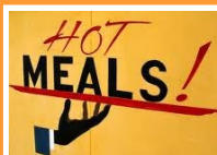
Table Fellowship for the WEEK OF APRIL 23 St. Peter's Church 121 Church St.

Sun: Acts 2:42-47/1 Pt 1:3-9/Jn 20:19-31 Mon: Acts 4:223-31/Jn 3:1-8 Tues: 1 Pt 5:5b-14/Mk 16:15-20 Wed: Acts 5:17-26/Jn 3:16-21 Thu: Acts 5:27-33/Jn 3:31-36 Fri: Acts 5:34-42/Jn 6:1-15 Sat: Acts 6:1-7/Jn 6:16-21 Next Sun: Acts 2:14,22-33/1 Pt 1:17-21/Lk 24:13-35