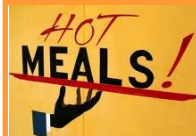
Table Fellowship for the WEEK OF MAY 7 St. Peter's Church 121 Church St.