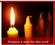
Prepare a way for the Lord