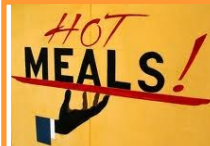
Table Fellowship for the WEEK OF NOVEMBER 19 St. Peter's Church, 121 Church St.

Lunch - Monday - Friday Noon to 1:00 PM Monday (November 20) Dinner 5:00 - 6:00 PM Pantry 6:00 - 7:00 PM Saturday (November 25) Dinner at 5:00 PM